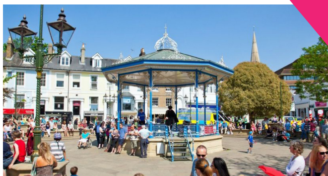
POTENTIAL HORSHAM BID AREA